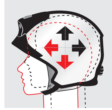
Easy to adjust on all axes.

In addition to the size of the helmet inside, the center of gravity and the distance to the visor can also be adjusted. The positioning of the helmet's center of gravity on the longitudinal axis of the body keeps the head in balance. This increases the wearing comfort enormously and makes the firefighter almost forget that they are wearing a helmet.