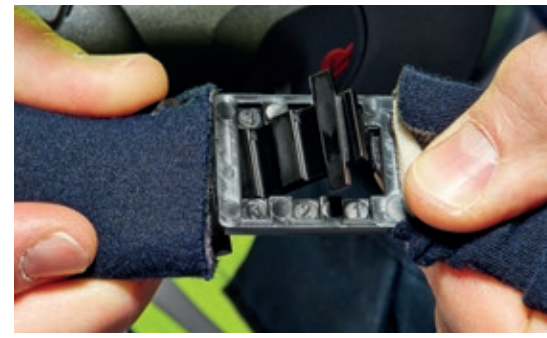
Setting the head circumference.