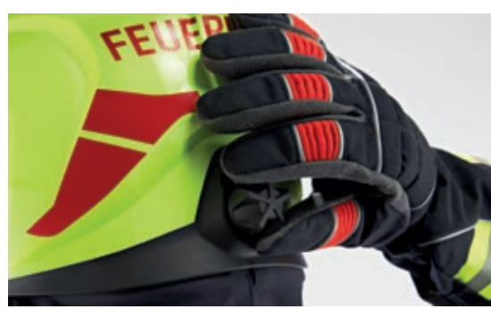
Width adjustment with the original HEROS rotary knob.

Low weight. Precise fit. Ease of service. Thanks to their low weight and sophisticated adjustment system, the Rosenbauer HEROS Titan and HEROS H30 firefighting helmets ensure a perfect fit - and this means maximum safety as well as outstanding wearing comfort. Added to this is the high level of convenience when cleaning and replacing parts.