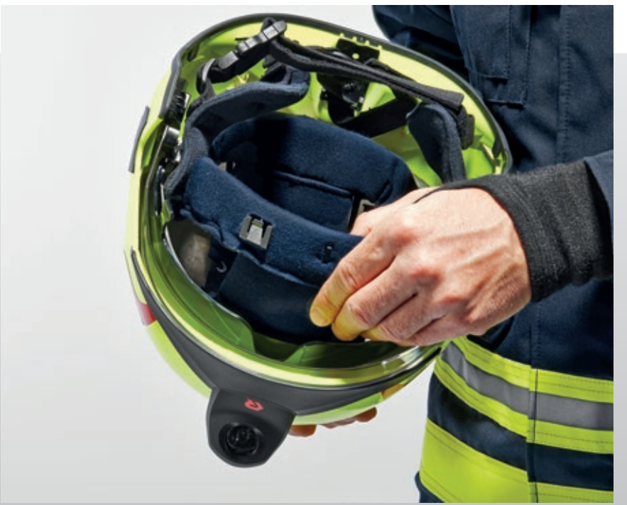
Assembly of the interior fittings without tools.

Maintenance and replacement of elements takes very little time with HEROS Titan and HEROS H30. With only 10 components, handling, washing or changing the internal fittings of the firefighting helmet can be done quickly. No tools are needed to dismantle individual textile components. Of course, the complete helmet is also washable; a special wash bag is available for this purpose.